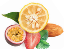
FRUIT OR NUTS