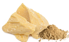
COCOA BUTTER and a pinch of LECITHIN